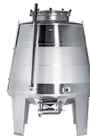
Red Ferment Tank